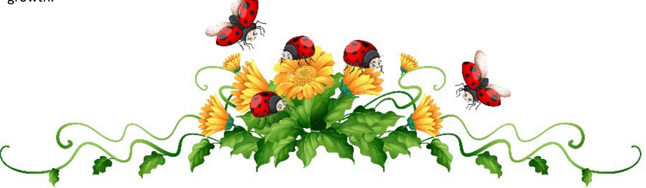
"The expert at anything was once a beginner."-Helen Hayes

A5: Objectives in homeschooling act as guiding stars, fostering a commitment to a personalized, proactive, and balanced educational journey, contributing significantly to the pursuit of knowledge and personal growth.